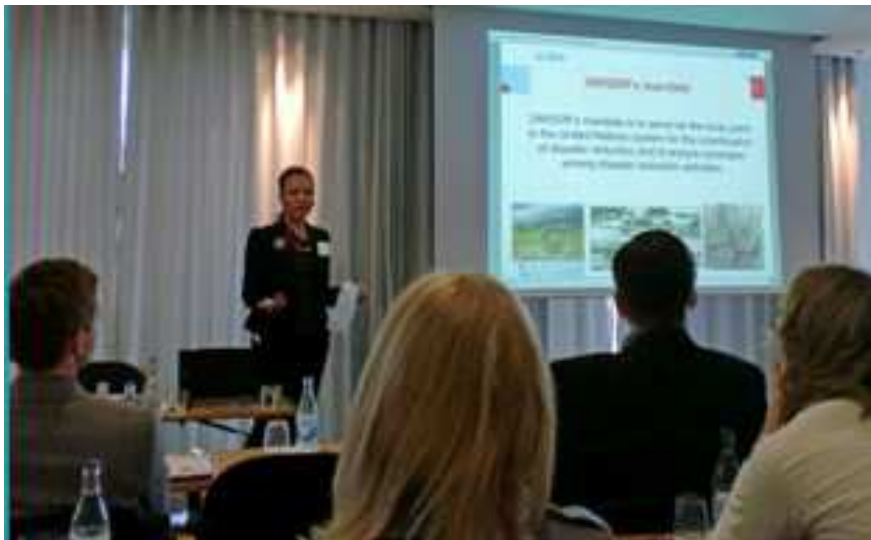
Spoke about the Global Assessment Report, Implementing HFA in Europe, and Making Cities Resilient campaign